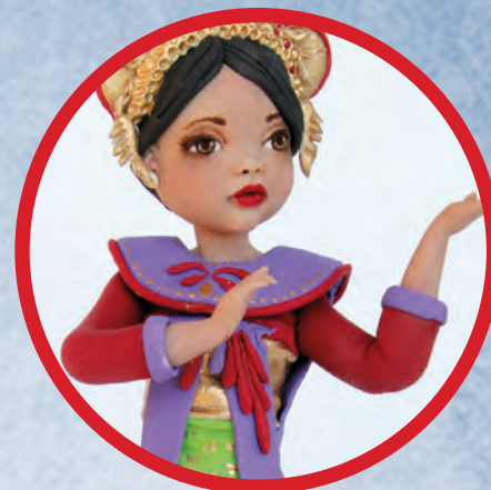
La Belle Aurore